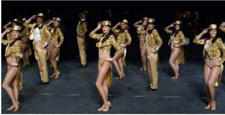
AND A FEW MORE PICS...